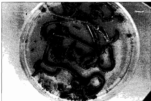
Photo 3 - Earthworms. Eisenia foetida .

among other factors, the relative abundance of each other for an adequate and complementary farming functioning. These studies set conditions for the design of integrated production systems, which can be easily adopted by the local producers. They also bring information which may be extrapolated to other species by calculating the amount of manure produced and the amount of earthworms necessary for its processing. As this approach must be designed within the bounds of economic reality and the ability to put it into practice, commercial tests were made at the local level to estimate the potential demand for meat and fur from the coypus and for humus produced by the worms. These studies take also into account the feasibility of future sales of live worms for the establishment of new modules, or as a protein source for commercial diets. The integration was made under the conceptual framework of sustainable agricultural development, working towards the implementation of systems sustainable in time from economic and environmental points of view. The very idea of using a valueless waste product (coypu manure) as the basic input for a productive activity (worms) is at the least an interesting approach to the theme. The operative focus used is based in concepts of Agroecology, understood as the science that unites understanding of ecosystems based in applied ecology with agricultural production (1).