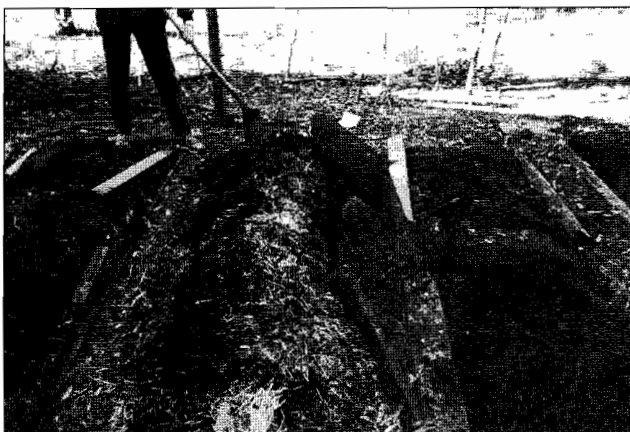
Photo 4 - A bed of earthworms at the research unit. Veterinary Faculty N.U.R. - The waste of coypus is processed and transformed in humus.