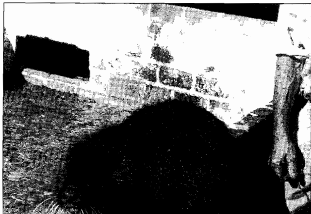
Photo 1 - Myocastor coypus . Variety obtained by breeders of a cooperative in Cordoba Province Argentina. Coypu variety "cagimo"